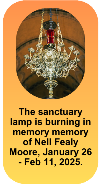
The sanctuary lamp is burning in memory memory of Nell Fealy Moore, January 26 - Feb 11, 2025.