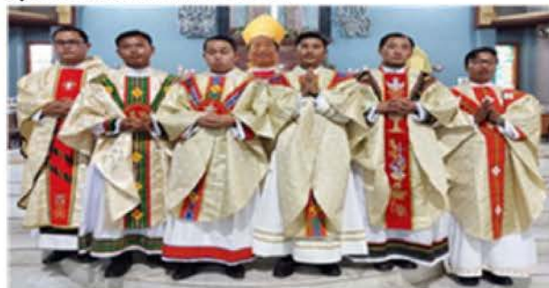
Archbishop is pictured with newly ordained priests.

Any financial support you can give to the Mission Co-op would be greatly appreciated.