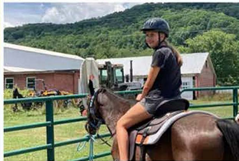
National Catholic Register

'Camp Carlo' Offers Catholic Youth Fellowship and Outdoor Adventure West Virginia summer camp is booked — for for good reason, according to campers and parents, who love soon-to-be St. Carlo Acutis.