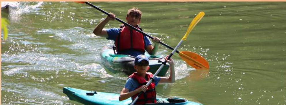
Below: Campers enjoyed kayaking and other fun activities while on retreat.