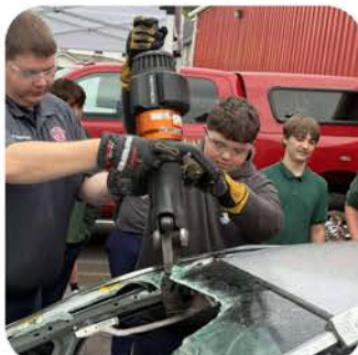
These students were able to practice using rescue tools.