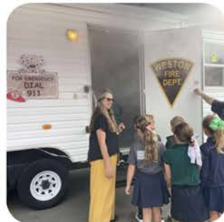
Students learn how to safely & quickly exit a burning building.