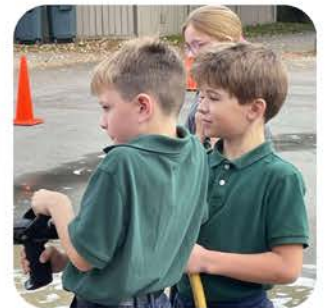
Students practiced putting out fires with fire extinguishers & fire hoses