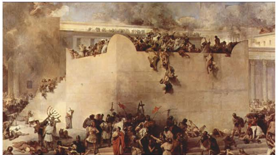
The Destruction of the Temple of Jerusalem - Francesco Hayez, 1867.

Sunday, December 14 Donut Sunday (sponsored by the Catholic daughters of the Americas)