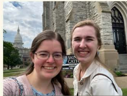
St. Mary's Cathedral, Lansing, MI