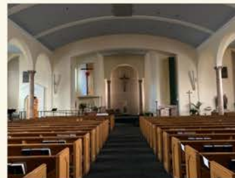
St. Thomas, Grand Rapids, MI