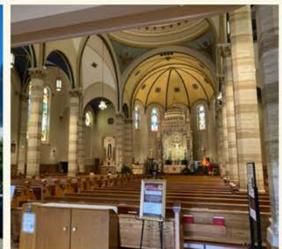
Basilica of St. Albert, Grand Rapids, MI