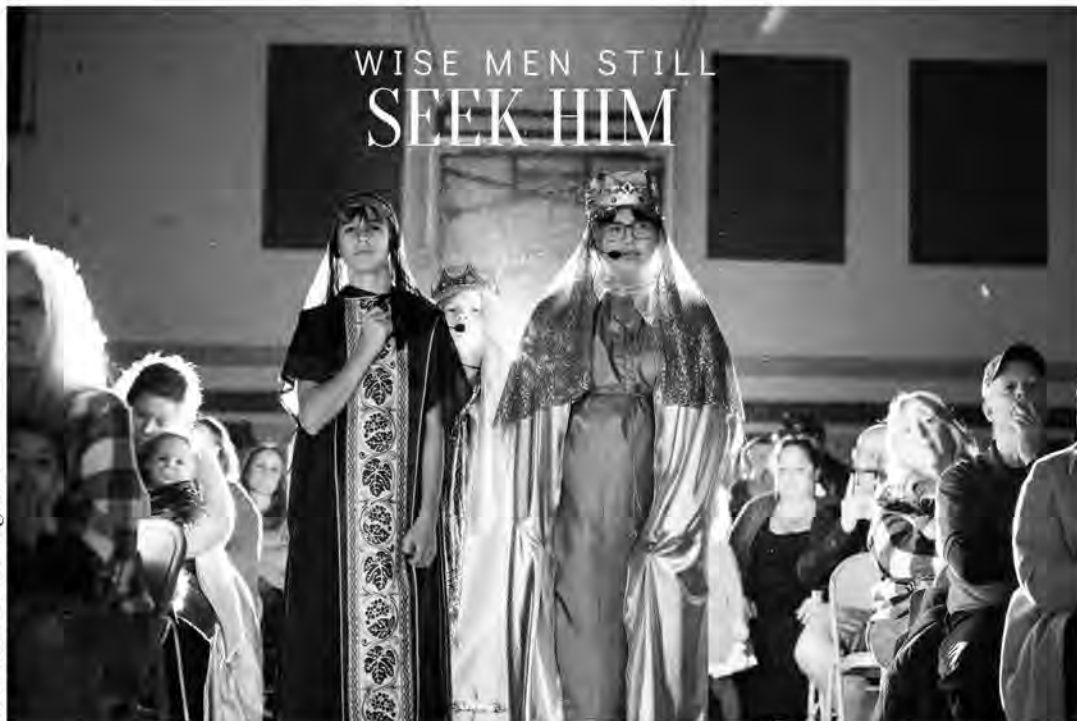
2024 Christmas Pageant