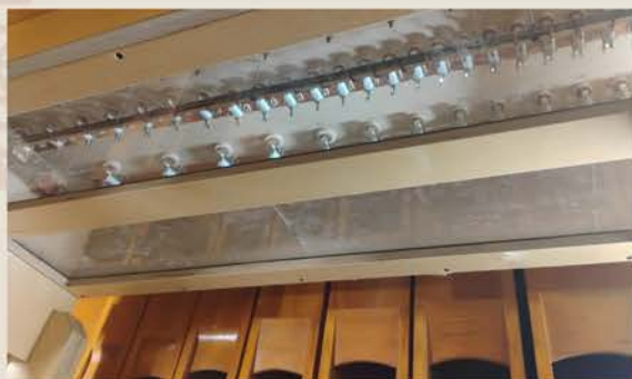
The Organ Wind Chest

The organ was installed in the early 1950s by the M.P. Moller organ Company of Hagerstown Maryland. The relatively small instrument had six ranks of pipes and approximately 400 pipes spread over two keyboards and a pedal board. No information of the previous organ is known which serve the church until 1952.