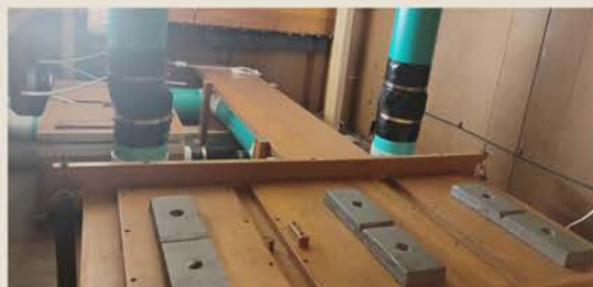
The Organ Wind Reservoir