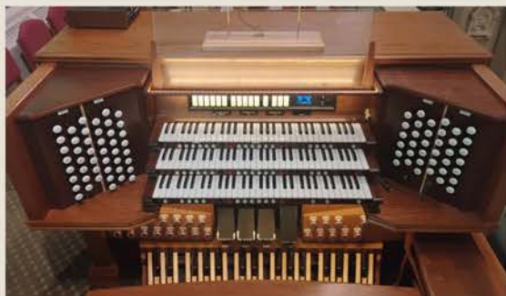
The Organ Console

I am writing a more detailed explanation about the pipe organ rebuilding to the congregation of Saint Patrick Church because a very generous parishioner has made an offer to match dollar for dollar contributions dedicated to paying off the organ fund loan. I have also included photos of the organ which most people cannot normally see.