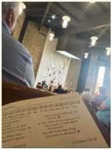
St. Bernard of Clairvaux, Indiana PA