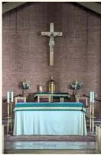
St. Joseph's, Hagerstown, MD