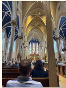
St. Mary's, Sandusky, OH