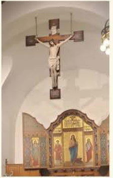
St. John the Evangelist, Wellsburg, WV