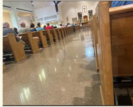
St. Mark the Evangelist Parish- St. Kilian Church, Cranberry PA