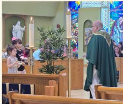
Saint Columbkil Parish in Boyertown, PA.