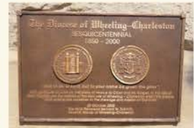
Basilica Of The Co-Cathedral Of The Sacred Heart, Charleston