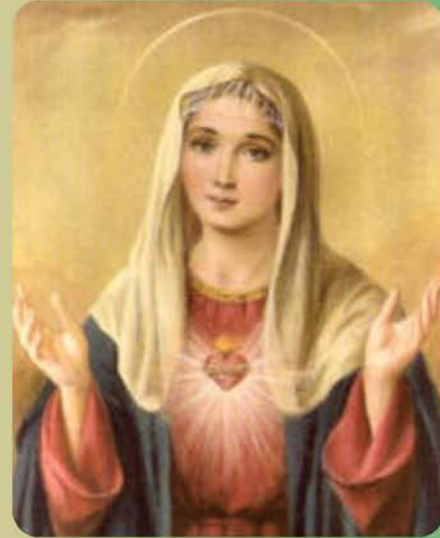
The month of August is dedicated to The Immaculate Heart of Mary.

Some of us here present may be among these foolish ones. We may have let this world get such a grip on us that we have no time or thought for the world that is to come. For such foolish people, and indeed for all of us, today's warning is that our call to judgment will come on each one of us like a thief in the night, at a moment when we least expect it. This need not be a sudden death. Of every thousand who die after long illnesses in our hospitals, there rarely is one who knows and admits he is about to die, so actually all deaths are sudden, that is, unexpected.